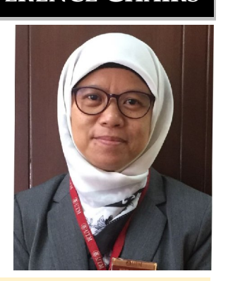
spect in the nearest future. Univ. of Auckland, New Zealand

It is our pleasure to welcome you all to the maiden edition of the International Conference on Global & Emerging Trends (ICGET). The theme of the conference is 'Global Trends: Visions, Opportunities and Challenges for a Sustainable Future', hence, discussions, presentations and other activities during these three days will focus on this description of the journey to our collective future as mediated by trends in technological development. The various changes around